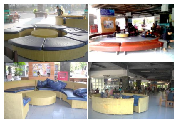
Fig. 5. Circular Seats Without Backrest (Left), Circular Seats With Backrest (Right) (Source: Observations, 2016).