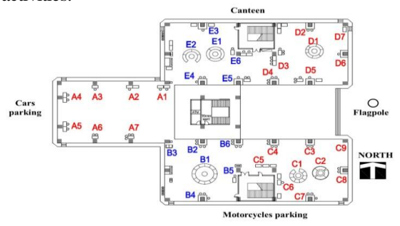
Fig. 3. Seating Codes in KPFT UGM.

Seating codes were given on each of the seats on the KPFT UGM to facilitate observation. The seating codes then applied on the questionnaire to understand the students' sitting preference that relate to their activities.