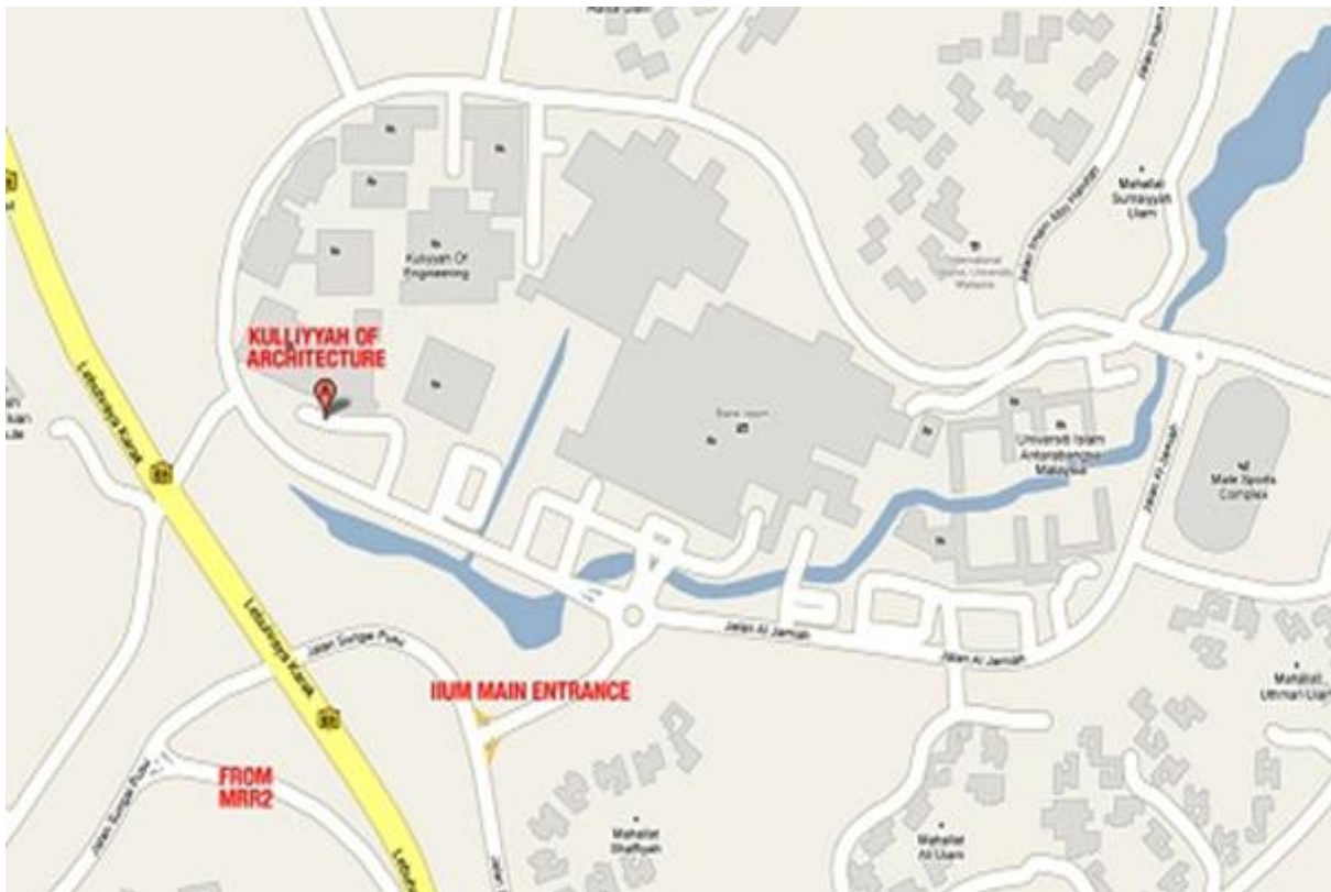
Figure 1. Location map of IIUM showing KAED

The selected pavement surfaces were the representative of typical urban and sub-urban thermal environment. The information gathered over the observational period was screened so as to exclude rainy, overcast and high mean wind speed days and