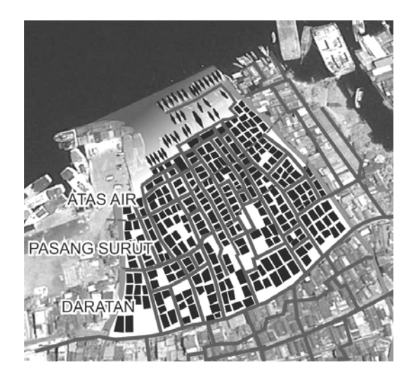
Figure 2. The settlement Pattern at Cambaya Coastal Area, Makassar

The type of the construction of the stilt house at Cambaya tends to be unable to hold the blowing of the hurricanes because of the light of materials and construction and the simple joint. Construction of roof which has a fairly wide span without a support beam between the roof truss, and the dimensions of the roof truss are not balanced with the wide, will cause deflection.