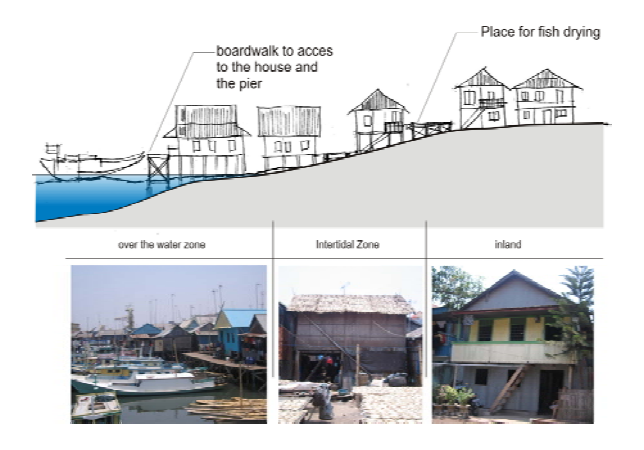
Figure 3. The Illustration of Settlement Characteristics of Cambaya Coastal Area, Makassar

On the wall construction, the high air-pressure occurs on the wall surface directly towards the wind direction. The stilt houses at the Cambaya coastal area have flat outside-wall surface without profiles so that the wind blows the wall and then to the side of the building and it does not give circulation effects which can lift up the building elements.