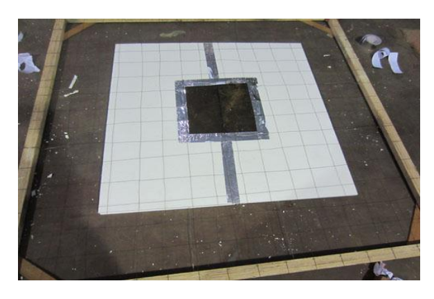
Figure 9. Placing Pakis-Styrofoam Panel to Woodden Hotbox Frame

Each pakis block has different size and weight. Therefore two pakis blocks are only selected to which the characteristic is close to each other. Putting together two pieces of pakis blocks to a styrofoam panel of 1m \times 1m is by sticking aluminum foil to the styrofoam panel, then the pakis-styrofoam panel is placed in the middle of hot-box woodden frame of 1.6m x 1.6m by small wires. Aluminum foil is used as reflectant heat to the gap of pakis blocks and styrofoam panels.