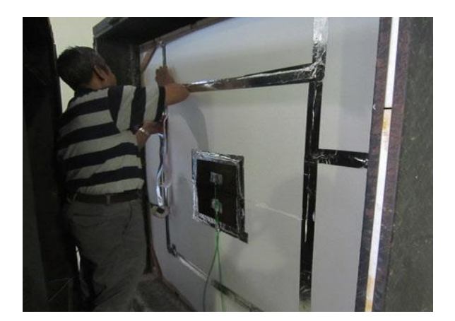
Figure 5. Placing Pakis Panel 1m x 1m at hotbox