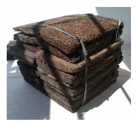
Figure 7. Pakis Blocks sold in the Market