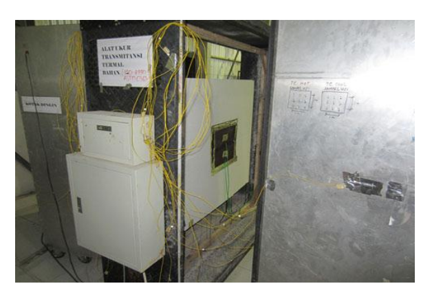
Figure 2. Controller & Hotbox

Figure 1. Guarded Hotbox Equipments with Thermocouple & heat flux transducer sensors [TC:thermocouple; HF:heat flux transducer]