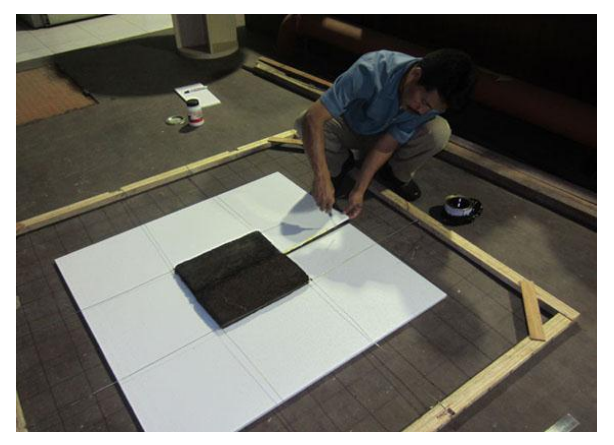
Figure 8. Attaching Pakis Blocks to Styrofoam