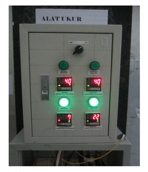
Figure 11. Temperature Controller running on Hotbox Equipment