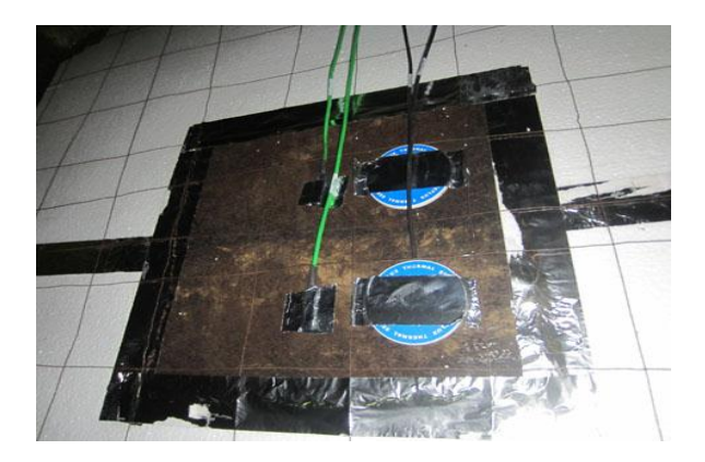
Figure 4. Attaching Thermocouples & Heat Flux