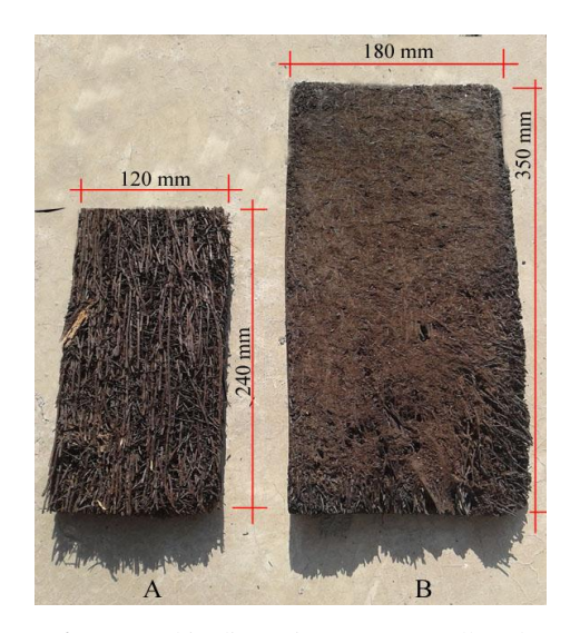
Figure 6. Two Pakis dimensions; (A). Small and porous; (B). Large and semi-solid

Scientific notes on specimen test (two large pakis blocks):