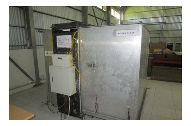
Figure 3. Hoxbox in Guarded Laboratory Environment for Getting in-situ Data