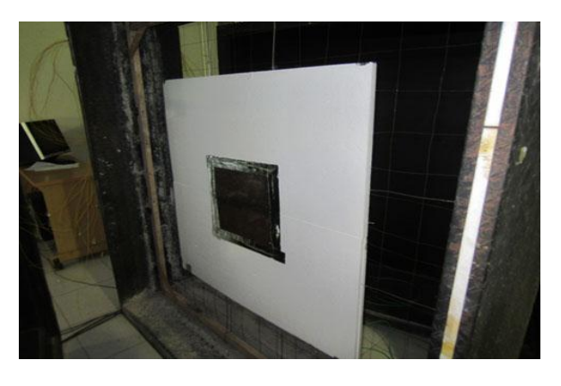
Figure 10. Pakis-styrofoam panel 1.00 x 1.00 m

After the pakis-styrofoam-woodden frame attching to hot-box equipment (fig.10), all boxes (hot and cold) are closed tightly to prevent hot air outflow to guarded box (laboratory environment)(fig. 2 & 3). Steady-state heating techniques are to be applied to two pakis blocks on styrofoam panel for 4 to 6 hours till the heat flux becoming steady in cold domain. The temperature in the hot-box sphere is set to 40°C and 18°C in the cold-box sphere; so there is 22°C temperature difference to driven enough the hot air piercing through the pakis blocks (fig. 11). No hot air will penetrate through the pakis-styrofoam panel due to its thermal characteristic of insulation. The styrofoam panel has also been tested for fire resistance rating to put off mealting state. The measurement will be recorded every 10 minutes to the controller, and all the data will be accumulated with Loggemet software made from Campbell Scientific.